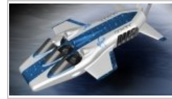
Necker Nymph: underwater flying becomes Virgin territory