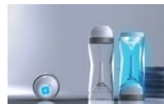
Pureray ultraviolet baby bottle sterilization concept