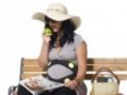
Nuvo's Ritmo is an advanced sound system for the next iPod generation