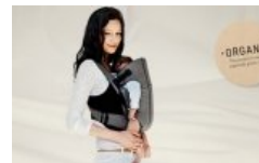
Baby Bjorn goes organic with its new baby gear