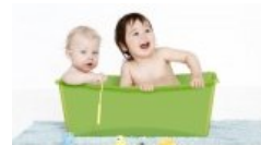
Flexi-bath folds up flat when baby's bath time is over