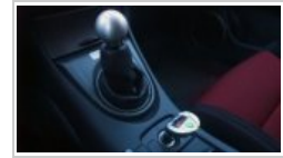
Video: SoundRacer V8 turns your boring family car into a fire-breather