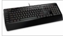
Microsoft's SideWinder X4 Keyboard ain't afraid of no ghosting